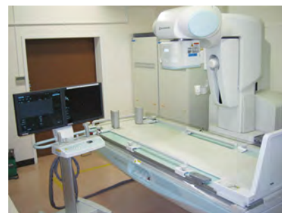
Fig. 3 SONIALVISION G4

the visibility of subtle, pale contrast of contrast media as well as the increasing employment of endoscopy for various purposes and increasing use of fluoroscopic recording for swallowing imaging. High-definition fluoroscopic images have also become an effective tool for recognizing subtle lesion changes during stomach radiography examinations and enema examinations. Improvements in fluoroscopic image quality, as well as shortened examination times, have been essential in improving the quality of medical care at this hospital. Nevertheless, it would be short-sighted to focus only on image quality and result in increasing exposure dose. Having given both these requirements equal concern in choosing the model of system, because of the substantial noise reduction achieved during fluoroscopy and radiography examinations resulting in lowered exposure dose and improved image quality and because of the safety of use, we chose the Shimadzu SONIALVISION G4 ( Fig. 3 ).