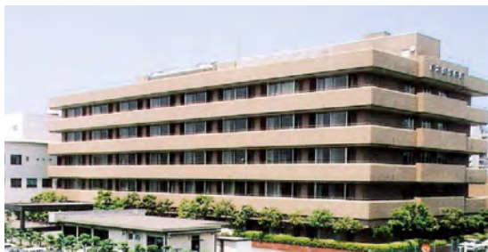
Fig. 1 External View of Nihon Koukan Hospital

When Nihon Koukan Hospital ( Fig. 1 ) was founded in 1937, it was the first general hospital in Kawasaki City, Kanagawa Prefecture. The Koukan Clinic ( Fig. 2 ) was established in October 2003 as part of the Nihon Koukan Hospital. The hospital is visited by around 1,100 outpatients every day and has 395 beds (45 for convalescent care). It plays the role of a central, community-based hospital, working in cooperation with local hospitals and clinics, and acting on the fundamental principles of the Koukan Association: "medical care that is holistic and patient-centered," "medical care delivered with sincerity," and "medical care firmly rooted in the local community."