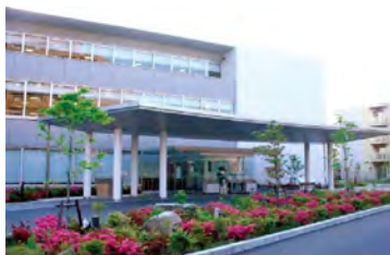
Fig. 2 External View of Koukan Clinic