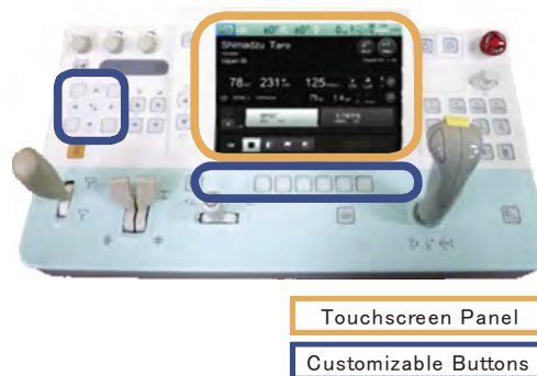
Fig. 8 Remote Console

The remote console has 10 customizable buttons and the local console has 8 or 10 customizable buttons that can be configured according to the uses of the hospital, with a resulting substantial increase in examination efficiency. The presence of customizable buttons on an R/F system that is used in a variety of situations is testament to the thoughtfulness of Shimadzu. Since we perform a large number of stomach fluoroscopy examinations and enema examinations at this hospital, many of the buttons have been allocated to inch switching.